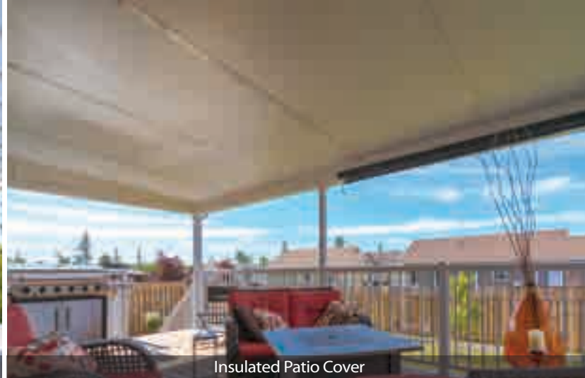
Insulated Patio Cover