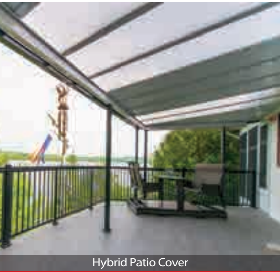
Hybrid Patio Cover