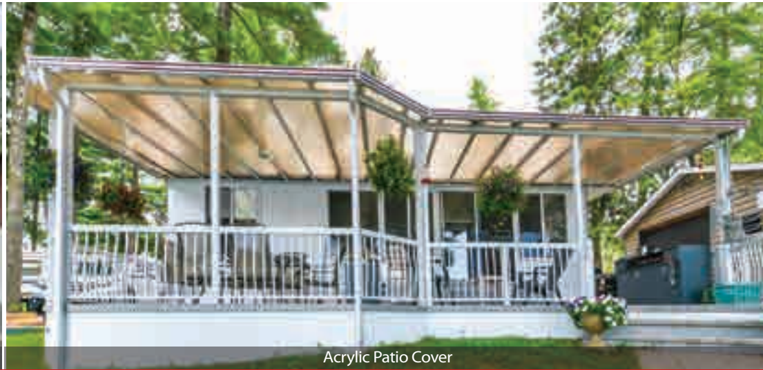
Acrylic Patio Cover