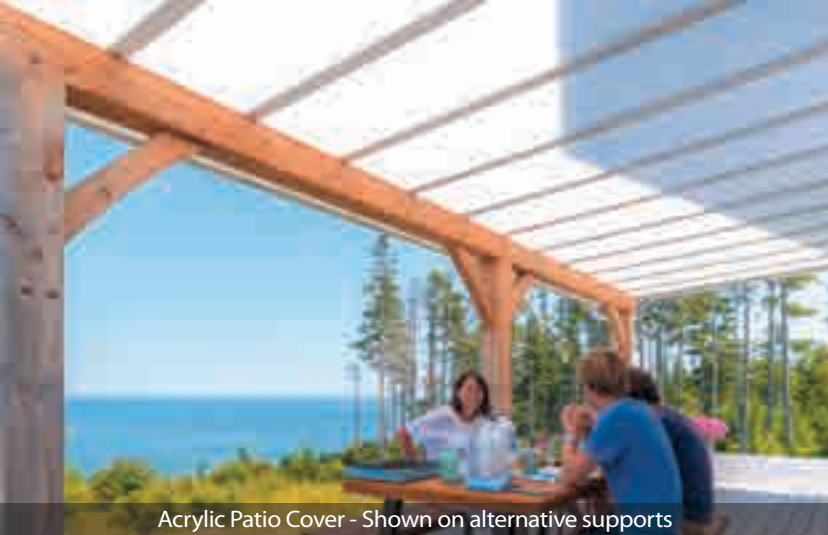
Acrylic Patio Cover - Shown on alternative supports