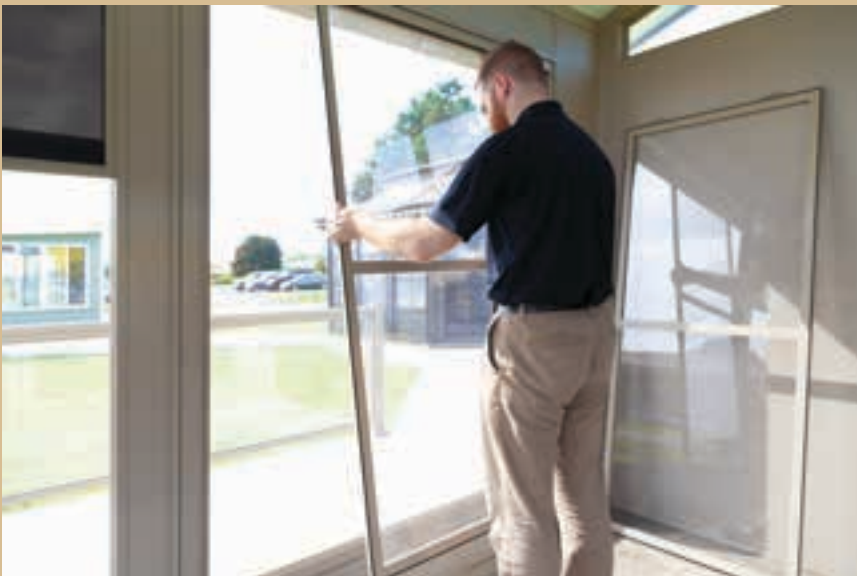
Spring loaded vents lift out easily for simple cleaning & storage